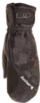
MP STOKED CAMO-BLACK