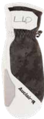
MP STOKED CAMO-WHITE

4oz PADDING, VELCRO TAB AT CUFF, ELASTIC WRIST ALL AROUND, SELF BINDING CUFF, EMBROIDERED MAX PARROT SIGNATURE AND AUCLAIR MOONS