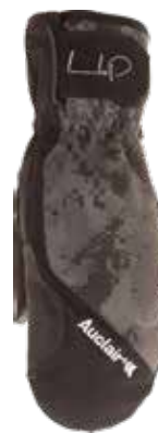
MP 50-50 CAMO

4oz PADDING, VELCRO TAB AT CUFF, ELASTIC WRIST ALL AROUND, SELF BINDING CUFF, EMBROIDERED MAX PARROT SIGNATURE AND AUCLAIR MOONS